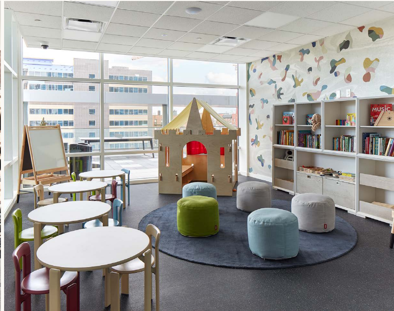
Fitness Center & Children's Playroom