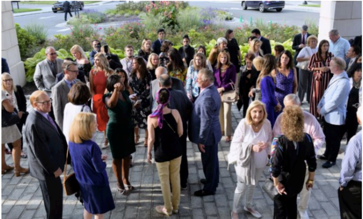
Group photo in front of Clubhouse.