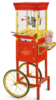
The vintage popcorn cart at 117 W. 21st Street is available for $180 on Amazon. Nostalgia

Furnishings sales — from companies like West Elm, Crate & Barrel and Joybird — skyrocketed since spring, according to Rakuten Intelligence, which tracks online shopping behavior. In September, sales reached a year-over-year peak of 69.1 percent. In October, the most recent data available, sales climbed 53.6 percent from October 2019.