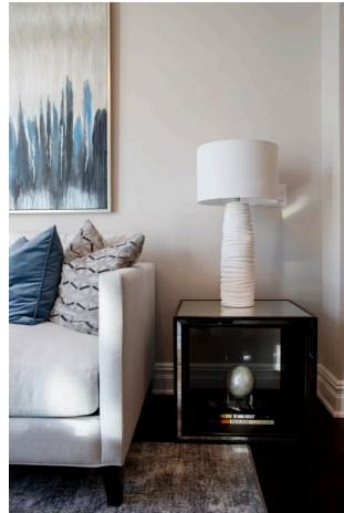
Schneps-Yunis got super chic furnishings fast.

"All I need to bring is a toothbrush," she said.