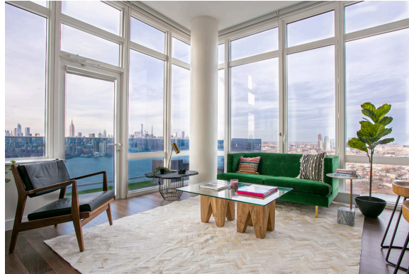
Rental units at Level in Williamsburg include the Jens Chair (left) from Design Within Reach ($1,795). The Avec Sofa (right) from CB2 at Level retails for $1,599.

November 19, 2020 New York Post: Real Estate