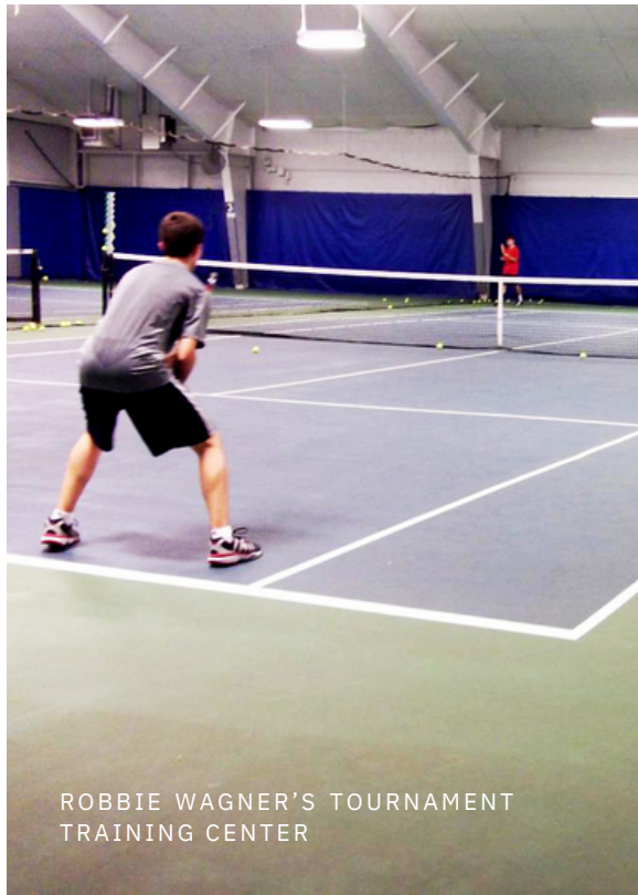
ROBBIE WAGNER'S TOURNAMENT TRAINING CENTER