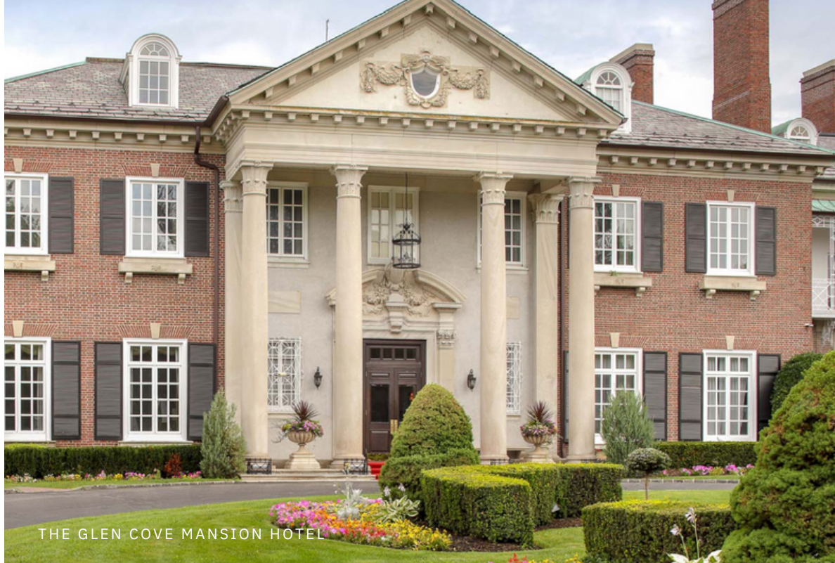
THE GLEN COVE MANSION HOTEL

RXR's approach to fostering community extends beyond the on-site amenities offered at its residences. Residents will benefit from discounted access to best-in-class clubs, services and culture, beyond the borders of their building.