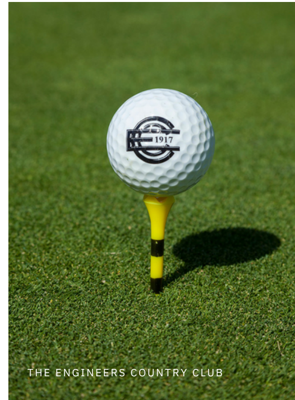
THE ENGINEERS COUNTRY CLUB